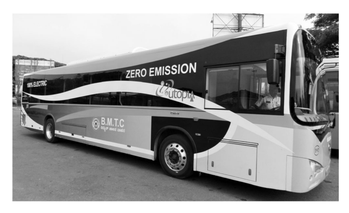
Figure 2. Electric bus introduced by the BMTC.

The travel cost for the diesel bus was calculated by multiplying the cost of 1 litre of high speed diesel (HSD) with the total number of litres consumed by the bus on a particular date. The distance travelled per litre of HSD consumed was calculated by dividing the number of kilometres travelled by the number of litres of HSD consumed. The earning per kilometre for the diesel bus was calculated by dividing the revenue generated by the number of kilometres travelled by the bus on a particular day.