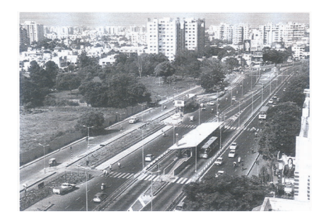
Median bus lane in Ahmedabad (Janmarg)

Chapter 6 is more technical and focuses on the mathematical approaches to public transport planning in the urban areas. It starts with a technical description of the basic structure of the classical transport model that is made up of four distinct categories of models. (a) Trip generation (frequency of origins and destinations of trips by trip purpose). (b) Trip distribution (estimation of target year trip volume by matching the origins