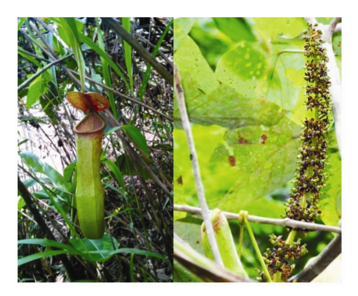
Figure 2. Pitcher and female inflorescence of N. khasiana.