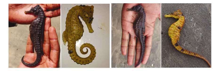
Figure 3. Seahorses Hippocampus kuda on Achara beach, Maharashtra.

region has good amount of rocky outcrops, mangroves and corals that form the natural habitat for the sea horses<sup>8</sup>. However this is the first observational record of seahorses thrown by the sea waves onto sandy shore.