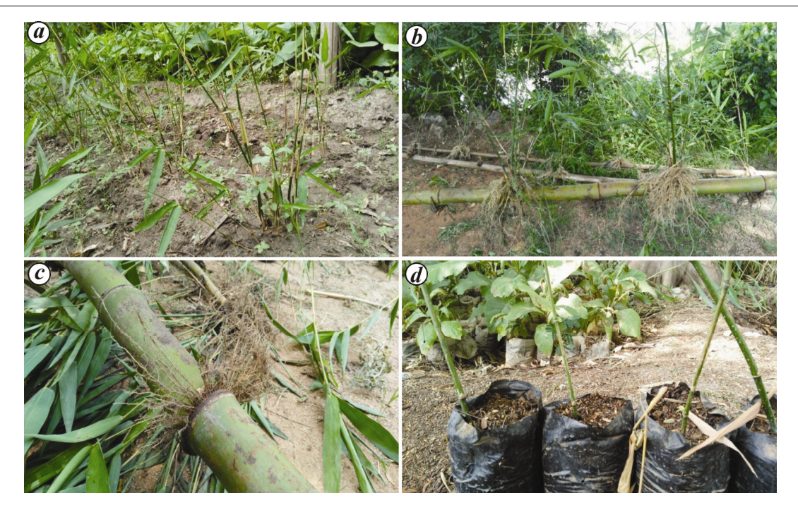
Figure 2. a, Emerged shoots at 28 days after planting (DAP) from culm of Bambusa vulgaris . b, Emergence of shoots and roots at alternate nodes of culm. c, Rooting all around node without shoot emergence on first basal node of culm. d, Transplanted shoots of B. vulgaris in polythene bags.