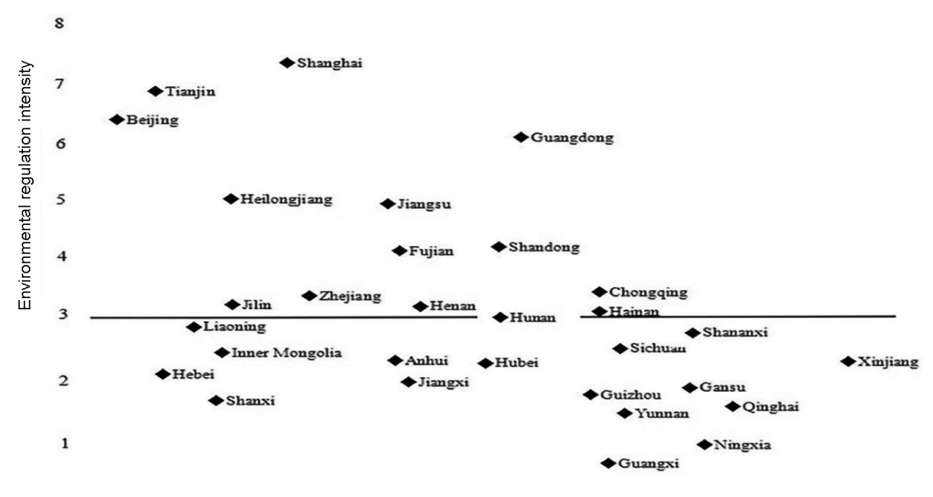
Figure 2. Distribution diagram of provincial average environmental regulation intensity in China.

*******: 1%, 5% and 10% significance level respectively. The values in brackets are t-test values of the regression coefficient.