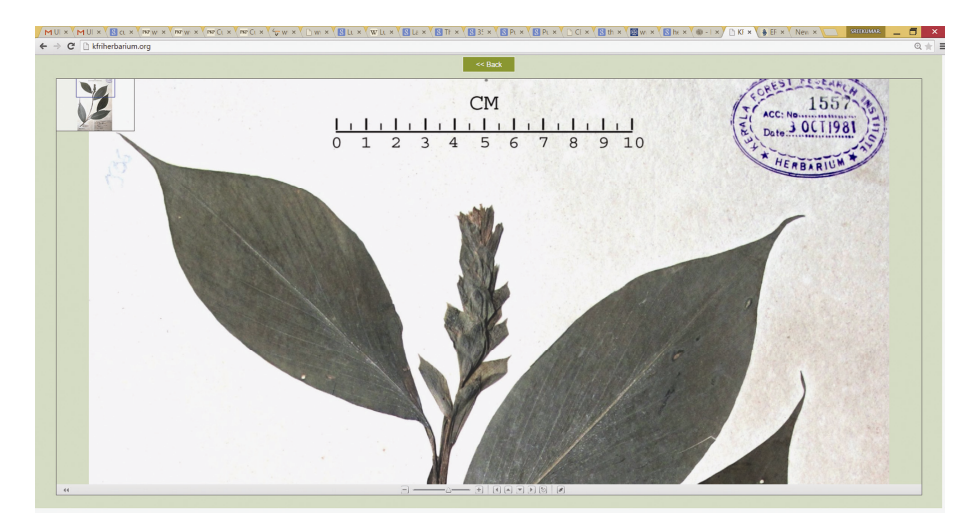
Figure 4. Zooming option to enable study of micro-morphological features.

Biodiversity Boards, universities, research institutions, students and teachers. KFRI herbarium data can be accessed at <u>http://kfriherbarium.org/</u>