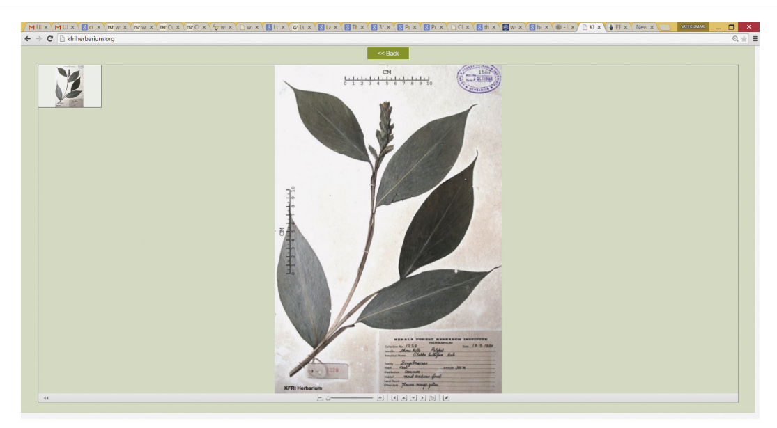
Figure 3. A specimen webpage.