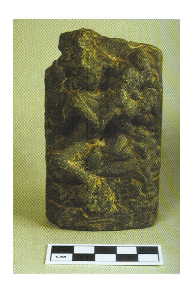
A weathered sculpture of Hara Parvati found from a 'pit' belonging to Period II. The sculpture is made of black basalt.

Excavations at Balupur have revealed the cultural history of the period between 7th and 19th centuries CE, supported by absolute dating methods such as <sup>14</sup>C and OSL of individual cultural periods. Agriculture and trade were the mainstay of