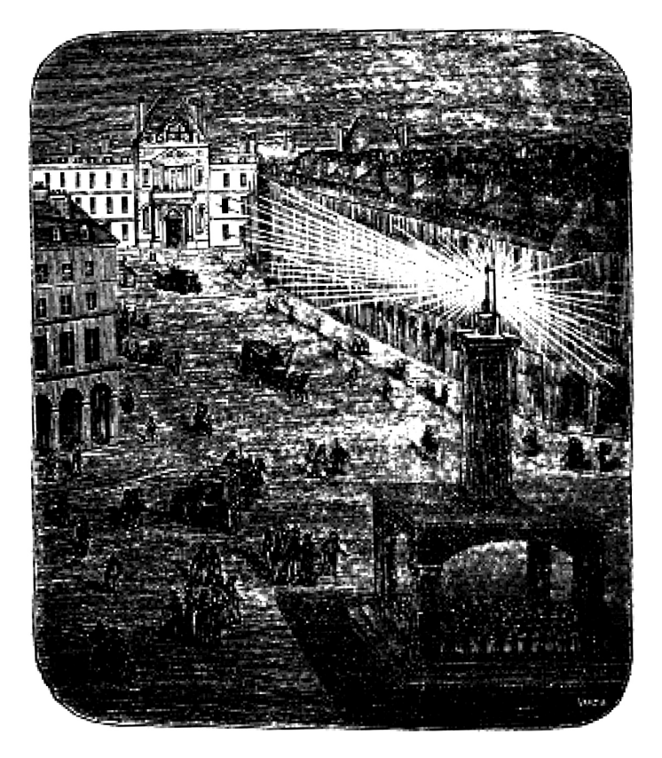
Figure 4. A building used in the Marathi book (p. 162).