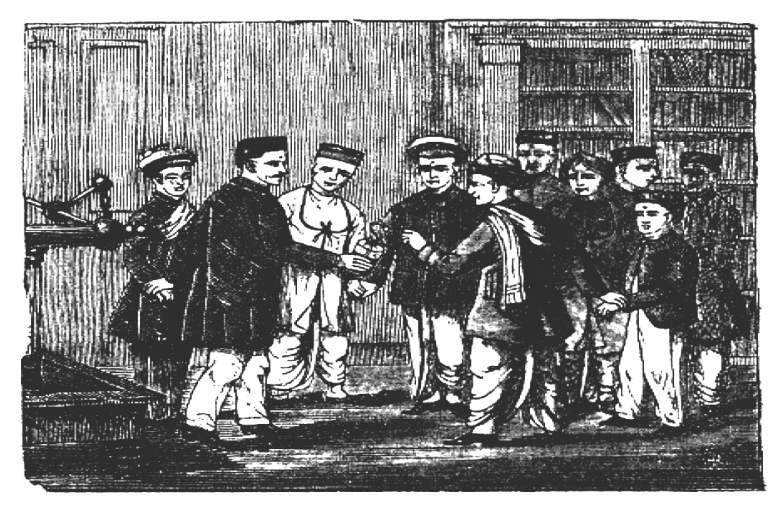
Figure 2. Electricity experiment in a Marathi version (p. 98).

There were several reasons behind the worldwide popularity of Ganot's books throughout the world<sup>8</sup>. Figure 2 shows a