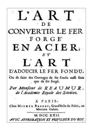
Figure 1. Cover page of René de Réaumur's The Art of Converting Iron into Steel, and of Rendering Cast Iron Duc tile... .

René Antoine Ferchault de Réaumur (1683–1757), popularly known in various science disciplines, especially entomology, provided clarity on steel production through his classic l'Art de Convertir le Fer Forgé en Acier, et l'Art d'Adoucir le Fer Fondu, ou de faire des Ouvrages de Fer Fondu aussi Finis que de Fer Forgé (The Art of Converting Iron into Steel, and of Rendering Cast Iron Ductile ...) (Figure 1)<sup>11</sup>. Following de Réaumur closely, an English inventor Benjamin Huntsman (1704-1776) perfected the technique of producing cast steel, which is also referred as 'crucible steel,<sup>12</sup>. These developments influenced Josiah Marshall Heath' to consider steel production in Madras Presidency (note 6).