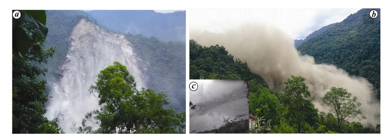
Figure 1. Photographs of ( a ) the Mantam landslide, ( b ) dust cloud from the landslide, ( c ) artificial lake formed due to the landslide dam.

Landslide resulting in river blockage presents a serious threat to downstream settlements. In recent times, we have recorded two large events of valley-blocking landslides in the Himalaya. The August 2014 Sunkoshi landslide<sup>8</sup> resulted in a ~2 km long lake on the Sunkoshi river, which is one of the main tributaries of the Kosi River as it enters India. This has led to large-scale human evacuation in Bihar. Similarly, the Phuktal river landslide9 in Jammu and Kashmir, India resulted in the formation of a ~17 km long lake which needed regular monitoring to avoid major flash floods in the downstream areas. The water impoundment in case of the 'So Bhir' landslide is a potential threat to settlements in downstream areas and to the Teesta Stage-V project of National Hydroelectric Power Corporation (NHPC). We estimated the volume of lake water from a 10 m CartoDEM using the polygon volume method. The water volume was estimated as 2.16 million m<sup>3</sup> and assuming that the lake would be emptied in 30 min in case of a sudden breach, the discharge was estimated at 1202 \text{ m}^3/\text{s} . For this amount of discharge, we carried out a risk analysis for possible inundation due to flash floods for a distance of