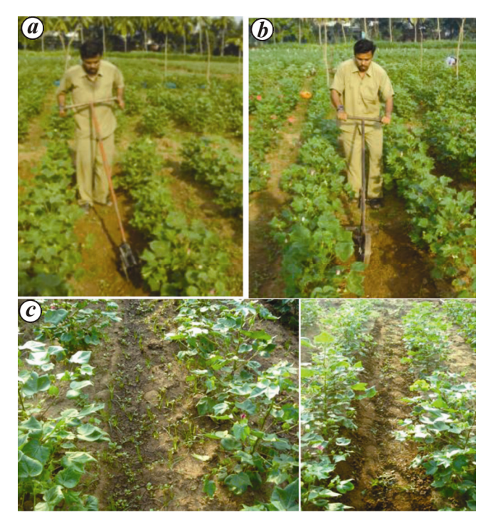
Figure 4. Weeding operation in the cotton field. a , Twin wheel hoe; b , Developed weeder; c , Before and after weeding operation.

The performance of V and S was higher than T. The draft force requirements were 17.43, 21.81 and 21.67 kgf,