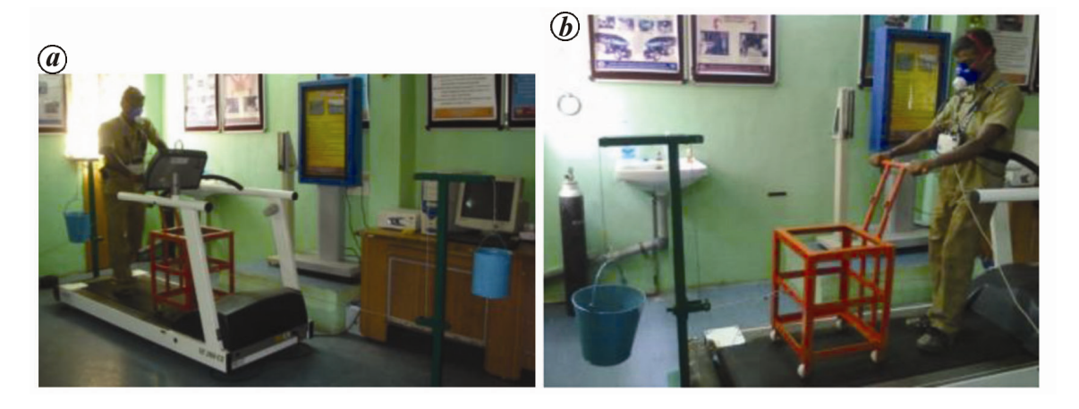
Figure 3. Performance on developed test rig. a , Push force; b , pull force.

were measured which include HR, VO_2 consumption and EC. LCP was calculated based on the mean HR response. The recorded data was downloaded to a computer and analysed. The mean values of 6th to 15th min of operation were selected<sup>12</sup>. The safe and comfortable opera-