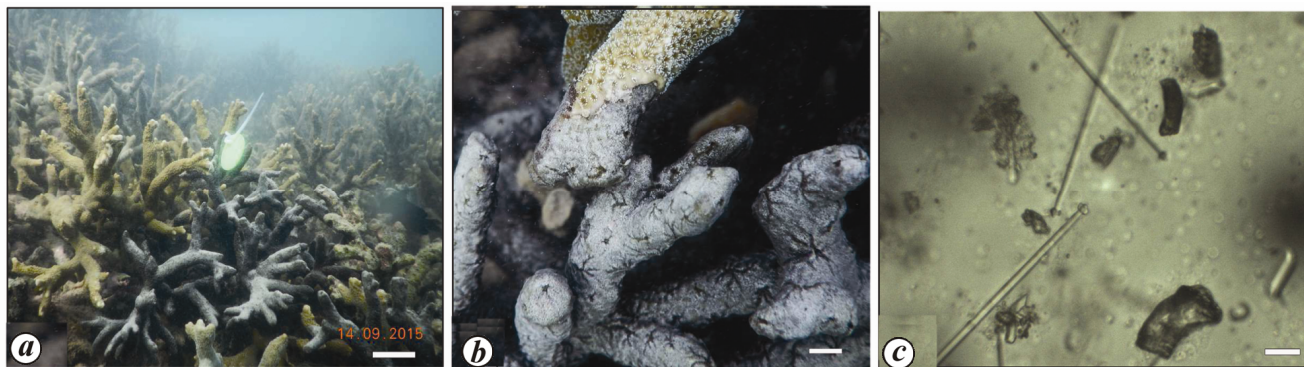
Figure 1. T. hoshinota on reefs at Vaan Island, Gulf of Mannar. a , T. hoshinota overgrowing live M. digitata colonies (scale 5 cm). b , Close-up of sponge showing numerous small oscula (scale 0.5 cm). c , Distinctive lobed tylostylespicules of T. hoshinota (scale 50 µm).