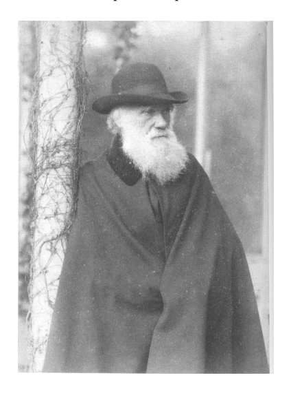
Darwin, c 1881.