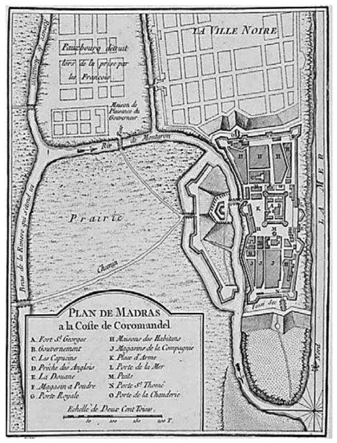
Figure 1. Map of the Fort St George and Madras by Jacques-Nicholas Bellin in Le Petit Atlas Maritime Recueti de Cartes et Plans des Quatre Parlies du Monde (1764, vol. III). Fort St George (A) – Fort St George. Gouvernement (B) – Principal offices of the government. Les Capuchins (C) – Residence of Friars Minor Capuchin priests. Prêche des Anglais (D) – English (Protestant) chapel. La Douane (E) – Customs office. Magasin à Poudre (F) – Gun-powder warehouse. Porte Royale (G) – Grand gate. Maisons des habitans (H) – Residences. Magasins de le compagnie (J) – EEIC Company offices. Place d'Arme (K) – Army station. Porte de la Mer (L) – Sea-facing gate. Puits (M) – An ornate fountain. Porte St Thomé (N) – St Thomas Gate. Porte de la Chauderie (O) – Chauderie Gate (Chauderie could not be deciphered; possibly it refers to 'Chattiram' (choultry). There was a Chairman gate to Fort St George in the 18th century). Riv. (Rivière) de Montaron – River Cooum. La ville noire – White town. La Mer – Bay of Bengal. Prairie – Grassland. Chemin – Road. Fauxbourg détruit lors de la prise par les François – Dilapidated residential suburb, because of the French army attack of Madras, led by Bertrand-François Mahé de la Bourdonnais in 1746. Maison de pleasance du Gouverneur – Governor's summer house.