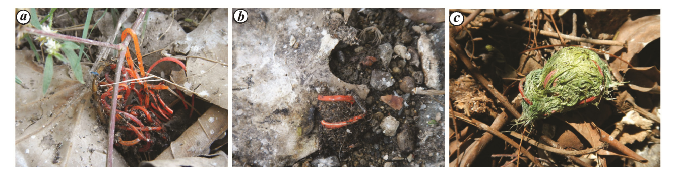
Figure 3. Rubber bands in regurgitated pellets of (a) Cattle Egret, (b) Little Cormorant and (c) Indian Pond Heron at Sirpur Lake.

polymer products (pulverized, micro and nano plastics) has become a serious threat<sup>26</sup>.