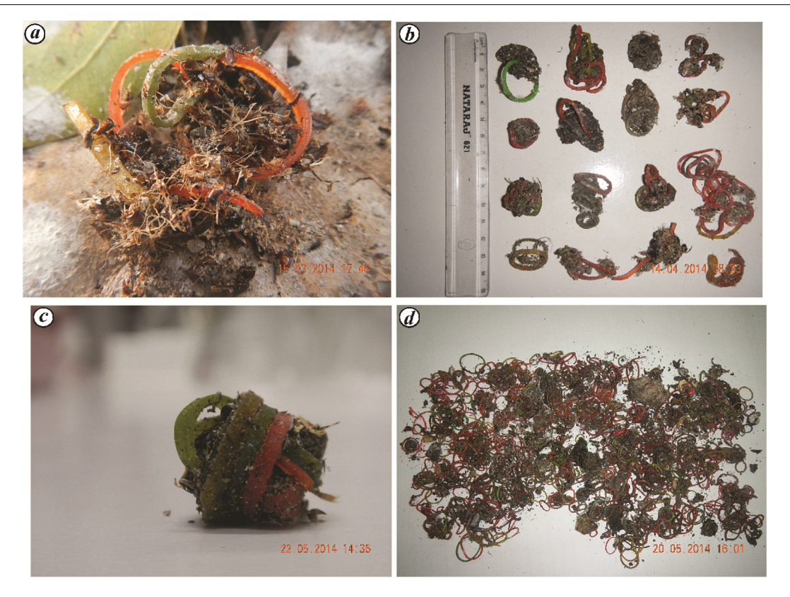
Figure 4. a, Regurgitated pellet with coloured rubber bands at the TNAU site; b, Overview of size of some selected pellets; c, Rubber band, highly coiled, in a pellet; d, Numerous coiled rubber bands in regurgitated pellets.