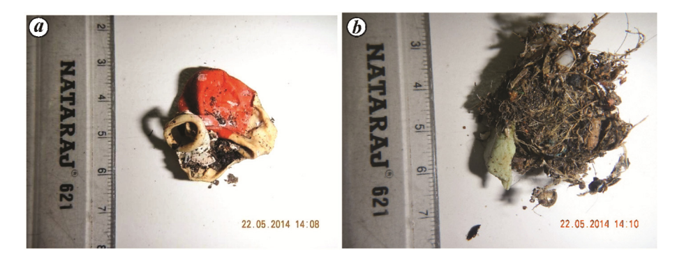
Figure 5. Rubber balloon (a) and plastic bits (b) in regurgitated pellets in TNAU campus.

early in the morning. Thus, the regurgitated pellets collected during the study would be from their last feeding bout. This also means that their last foraging grounds could be nearest to the roosting site, holding well in both the cases. However, after ingestion these items remain in their stomach for some time, causing a feeling of fullness, starvation and possibly death. Such incidences were reported from Midway Atoll<sup>36</sup>, parts of the Pacific<sup>37</sup> and Atlantic<sup>38</sup> Oceans. The artefacts in the guts are subject to digestive processes, and diverse chemicals such as plasticizers (phthalates), polyaromatic hydrocarbons, metals and others used in manufacture enter the birds' body<sup>31,32</sup>.