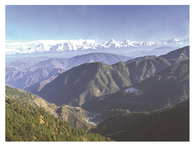
Figure 2. Photograph showing the Lesser Himalayan province, the narrow belt where the 2600–3000 m Lesser Himalayan ranges abruptly rise to the 6000–7500 m high formidable Great Himalaya, and the eversnowy Great Himalaya.