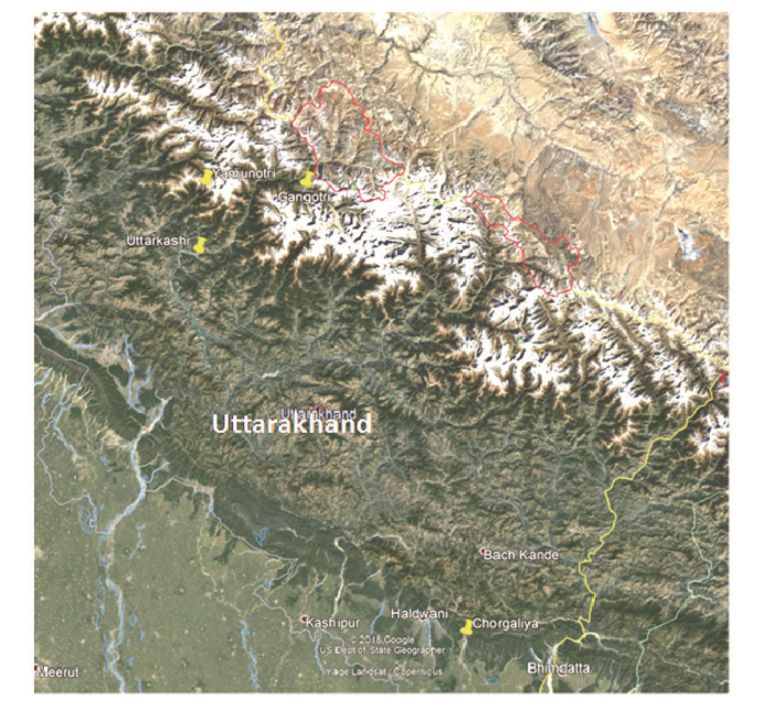
Figure 1. Satellite image of the central sector of the Himalaya and adjoining Indo-Gangetic Plains.

The melt water in the Great Himalayan realm contributing additional moisture, the 'orographic lifting' up on the steep to nearly vertical slopes produces convective clouds of large extent<sup>3</sup> causing intense rainfall – the rainfall rate being in the range 200-1000 mm/h (ref. 5) and 324 mm/h at Chorabari glacier, Mandakini valley in mere 24 h in mid June 2013 (ref. 6). The Munsiari area on the southern slope of the Great Himalaya in northeastern Uttarakhand has been receiving - in recent years - the highest southwest summer rainfall anywhere in the state. Coincidentally, this is the part of the Himalaya which is also registering the highest seismicity anywhere in the entire Himalayan province - in terms of the number of earthquakes of the magnitude 2 to 5 – implying almost continual release of tectonic stresses, the rate of stress drop being low. Comprehensive analysis of the Tropical Rainfall Measuring Mission 3B 42 and APHRODITE databases demonstrates that the rainfall values are very high up to an elevation of 3100 m and then fall substantially above that level<sup>7</sup>. According to the findings of the India Meteorological Department, the 1000-2000 m elevation levels receive maximum summer rainfall and then there is a sudden jump in precipitation near 4000–5000 m (ref. 7).