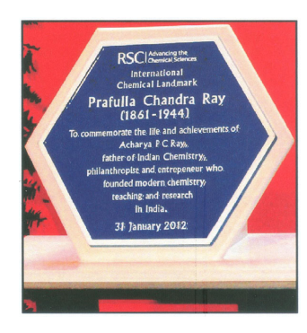
International Chemical Landmark Plaque.

Prafulla Chandra made early contributions towards platinum metal chemistry of sulfur ligands. Upon treating iridium tetrachloride (IrCl<sub>4</sub>) with dialkyl sulphides (R<sub>2</sub>S) in ethanol, he found the metal to be reduced to the trivalent state affording