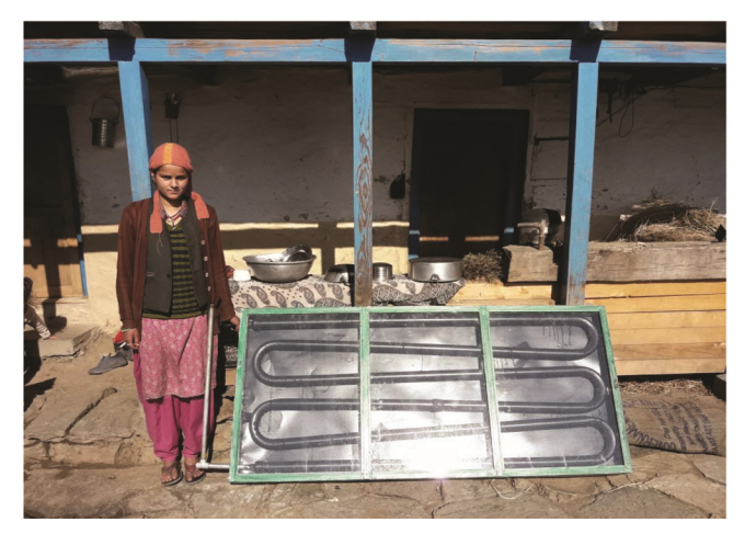
Figure 1. Mountain solar water-heating system in a rural household.

The mountain solar water-heating system was designed using local materials with involvement of rural artisans (carpenters and plumbers). This system is of dimensions 180 \text{ cm} \times 90 \text{ cm} (Figure 1). The outer frame was built of wood. Absorber sheet was made with galvanized iron sheet. Absorber sheet was insulated with thermocol on the back and the sun-facing side was fixed with specially designed aluminium alloy water coil of 18.01 capacity. Absorber sheet and water coil were coated with normal black paint containing amendments to absorb solar energy. Sun-facing side of the system was glazed with ordinary 3.5 mm window glass. The system was designed, developed, installed and evaluated prior to the programme