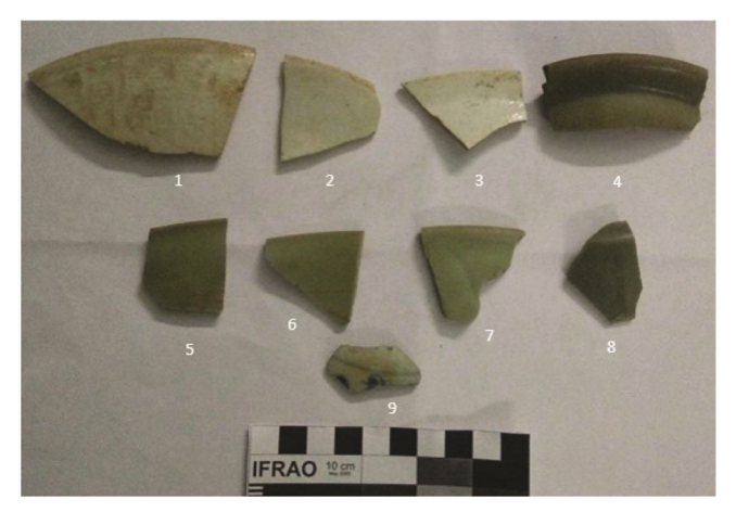
Figure 4. Chinese pottery collected during explorations at Manika-

Southeast Asian countries for maritime trade. Suppose Indo-Arabian stone anchors found in India belonged to an archaeological context before 8th–9th century CE, then, the period and perception of the introduction of Indo-Arabian stone anchors by the Arab mariners can be researched. The finding of Indo-Arabian stone anchors in the Red Sea<sup>18</sup>, Persian Gulf<sup>19</sup> and Indian Ocean region indicate Arab mariners' interactions in maritime trade and contacts. These Indo-Arabian stone anchors have also been reported from Iran<sup>17</sup>, Oman<sup>19</sup>, Sumhuram (Khor Rori),