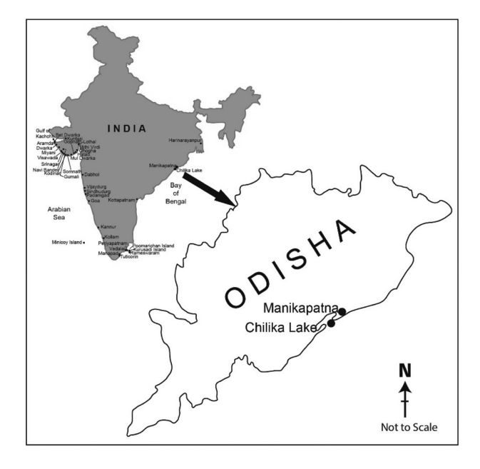
Figure 1. Map showing the stone anchor sites in India.

During the recent explorations along the Odisha coast, broken Indo-Arabian and composite stone anchors were discovered at Manikapatna and Kanas on the bank of Chilika Lake (Figure 3). One kellick stone anchor was recovered from the River Devi at Astaranga at 5 to 7 m water depth. Similarly, one-armed anchor with stone stock and wooden shank, as well as weight stone anchors were recorded along Konark coast and adjoining regions. Apart from the Indo-Arabian stone anchor, fragments of amalaka (notched stone disk), pieces of perforated window, pillar segments, dressed stone blocks and other architectural elements were observed near mosque during explorations at Manikapatna. The residents of Manikapatna informed that these findings were recovered while digging for the construction of a new mausoleum. All these architectural materials belonged to a temple. Moreover, Chinese ceramic sherds (Figure 4) of 13th to 14th century CE were also recovered, and these were produced in Fujian and Zhejiang Provinces of China (pers. commun.: Ran Zhang). Although different types of stone anchors have been recorded during explorations along the Odisha coast, this paper details the Indo-Arabian stone anchor of Manikapatna along with other findings and their role in the maritime contacts of Mani-