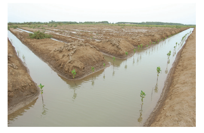
Figure 4. A typical canal system established in the degraded areas for regular flushing by tidal water.

The results of the study on the real cause of mangrove degradation and scientific method of restoration were communicated and shared with all the stakeholders,