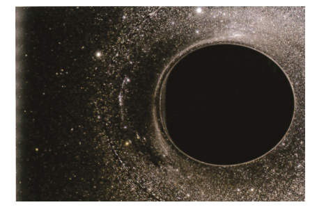
A field of many stars gravitationally lensed by fast-spinning black hole.

Renn in 'The genesis and transformation of relativity' provides an account of the long struggle that Einstein went through in formulating the field equations of general relativity. Renn describes Einstein's use of the equivalence principle and Mach's principle; his identification of the metric tensor of space-time as the descriptor of gravity and geodesic lines as trajectories; the prediction of light bending and gravitational redshift even before the completion of the