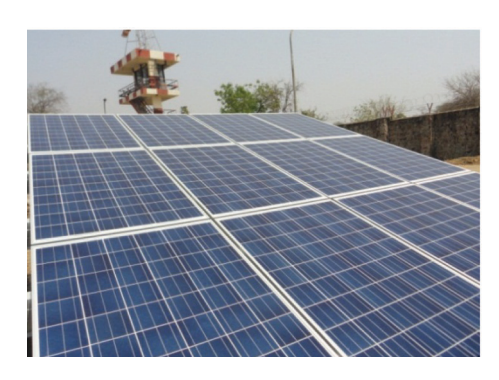
Figure 8. Solar plant.