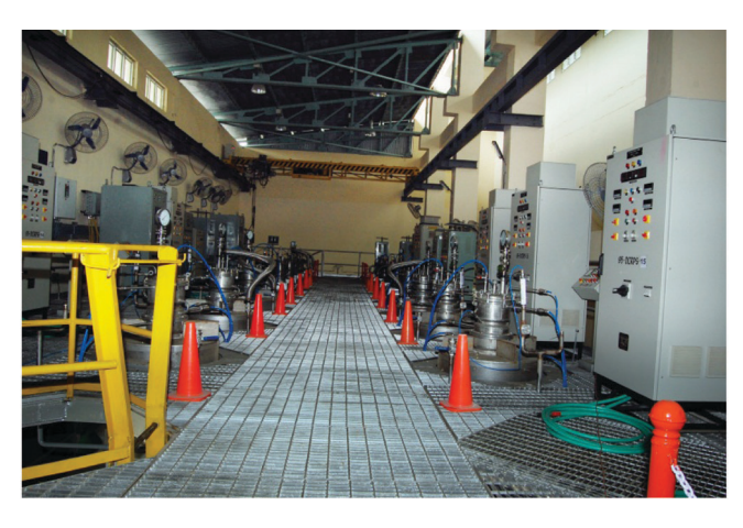
Figure 9. Electrowinning cell.

Sodium metal production technology involves molten salt electrolysis of eutectic mixture for sodium production followed by purification to nuclear grade. Test cells of 50