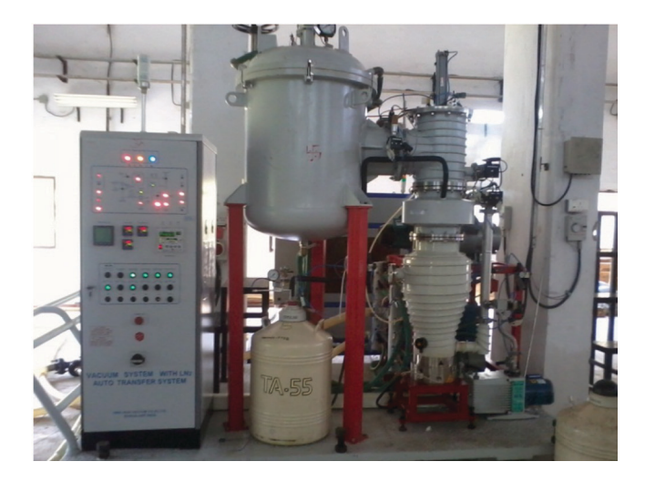
Figure 10. High vacuum induction furnace.