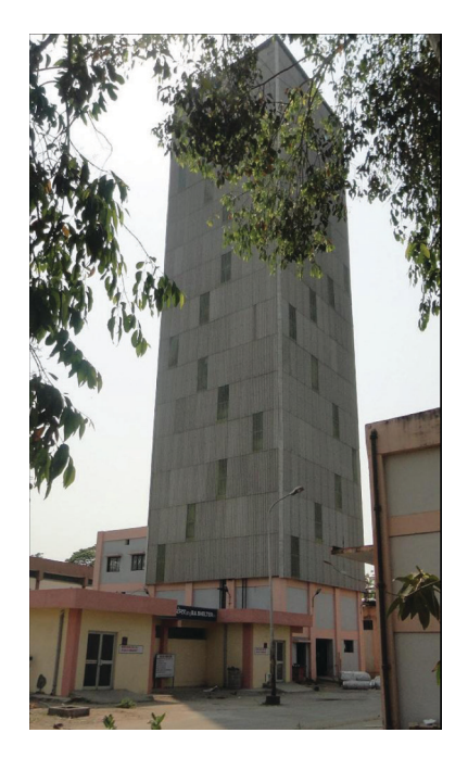
Figure 15. Industrial plant for production of O-18 water.

respect to hydraulics, internal reflux/adiabatic operation, pumping, operability and controlling issues. The prototype column was operated for a year and also utilized for upgradation of the off-grade <sup>18</sup>O-water to the desired IP. The off-grade <sup>18</sup>O-water available from various hospitals/institutions was upgraded to the desired concentration. The upgraded <sup>18</sup>O-water was tested for its intended use Fluoro Deoxy Glucose (FDG) and quality was accepted for application by Radiation Medicine Centre.