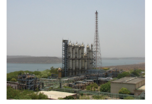
Figure 2. Heavy water plant, Kota.

Kota plant: This is the first indigenous plant (Figure 2). It is based on H_2S-H_2O bithermal chemical exchange process