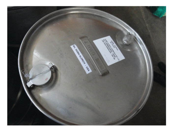
Figure 4. Export consignment of heavy water. CURRENT SCIENCE, VOL. 123, NO. 3, 10 AUGUST 2022

In 2021, HWB executed two export orders to South Korea and Japan for non-nuclear applications.