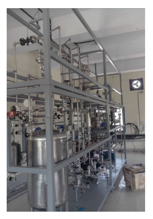
Figure 16. Re-combination unit.

The non-nuclear applications of heavy water include metabolism studies, NMR solvents, deuterated drugs/active