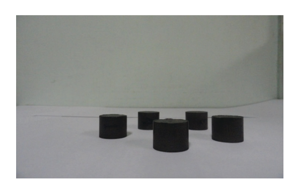
Figure 11. B4C pellets. CURRENT SCIENCE, VOL. 123, NO. 3, 10 AUGUST 2022

and 500 A rating, closed-type, were taken up for the development of design and operating data. Subsequently, a 2 kA test cell has been set up, commissioned and operated at the HWP in Baroda (Figure 12). Based on operating experience and various modifications incorporated on the 2 kA cell, a 24 kA single cell design has been finalized and installed at HWP in Baroda, which would serve as a prototype cell in setting up multiple 24 kA cells for 600 MTPA nuclear-grade sodium plant.