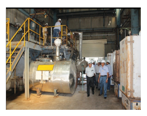
Figure 12. Sodium cell (2 kA).

The HWB has adopted the heavy water distillation process (under vacuum) for the enrichment of <sup>18</sup>O. Being the