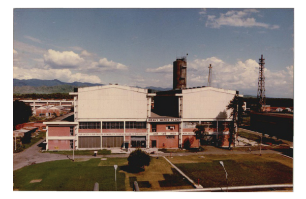
Figure 1. Heavy water plant, Nangal.

Heavy Water & Stable Isotope Production (HW & SIP) Section as part of the Chemical Engineering Division