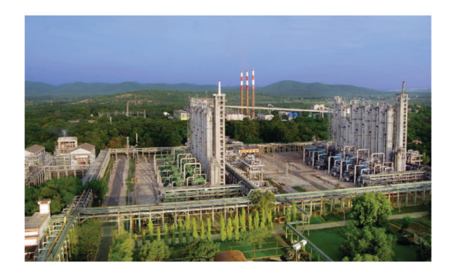
Figure 3. Heavy water plant, Manuguru.

Hazira plant: This is a two-stream HWP based on the monothermal NH<sub>3</sub>–H<sub>2</sub> exchange process. The plant is linked to the two-stream ammonia plants of M/s KRIBHCO Ltd, Hazira, Gujarat. It shows satisfactory performance owing