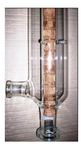
Figure 14. Glass column.

Subsequently, a single prototype column was set up at Tuticorin to validate the data and sort out issues with