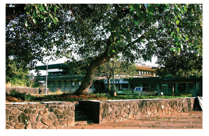
Figure 3. The Erstwhile Training School Complex (1970–2008), South Site, Trombay, Mumbai.