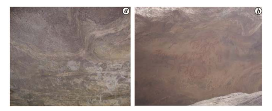
Figure 1 a , b . Cave paintings of Bhimbetka rock shelters, Madhya Pradesh, India.

Apart from mineral pigments, organic binders or colourants were used in some of the wall paintings in the Asian cultures from the late Bronze Age to the Roman era<sup>8</sup>. Arrays of organic binders have been reported from paintings of the Greek-Roman age to the Renaissance<sup>9</sup>. However, organic colourants were in restrictive use as they were expensive. The Getty Conservation Institute, USA and Dunhuang Academy, China, jointly surveyed the organic colourants used in different rock paintings of Asia during 2006-2010. The information generated and spectral database helped to identify the organic compounds used in the paintings of Mogao caves, Dunhuang, China<sup>10</sup>. A survey of the scientific literature from India revealed that the use of organic colourants in wall paintings has a long tradition as compared to European cultures<sup>11</sup>. Yü et al.12 catalogued the organic colourants used in ancient Chinese paintings. The extensive use of organic colourants in Asia might be due to the major distribution and