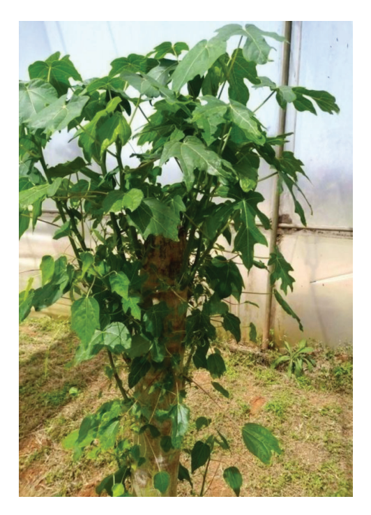
Figure 1. Induction of side shoots in mother plants sprayed with BA 100 \text{ ppm} + \text{GA}_3 250 \text{ ppm}.

The values with different alphabets are significantly different at P < 0.05.