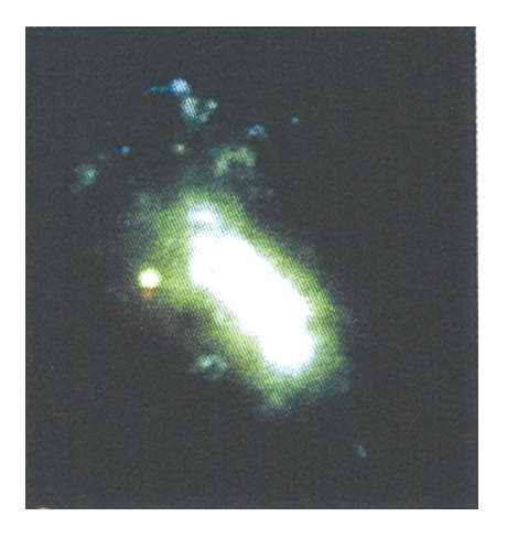
An actively star forming galaxy (NGC 4449) as seen in a VBT study. (Vainu Bappu Telescope: Silver Jubilee, 2011, IIA.)

The Science Congress held at Delhi in January 1947 under the presidentship of