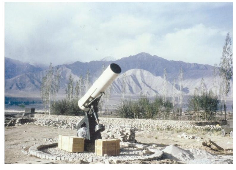
Figure 2. Bhavnagar Telescope at Leh.

Bhavnagar Telescope remained the biggest telescope in the country from its arrival at Poona in 1888–90 till about 1968. It took different forms and configurations and remained the only spectroscopic telescope for night-time astronomy in the country for several decades. It travelled widely, at least twice to Dublin, after arrival in Poona, and then to Kodaikanal. From Kodaikanal it went Kavalur and then to Leh and back to Kodaikanal.