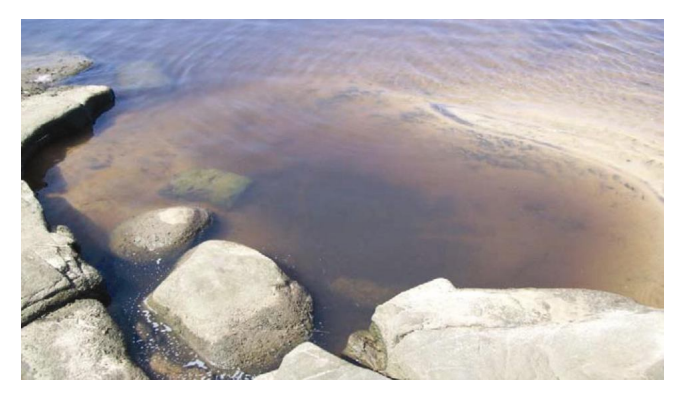
Figure 4. Discoloured, highly polluted waters of the Mvoti Estuary.

The waters have remained more or less neutral, while in some instances reaching mildly alkaline and mildly acidic conditions. Acidification of water, according to DWAF<sup>13</sup>, is commonly attributed to effluents from the pulp and paper, tanning and leather industries.