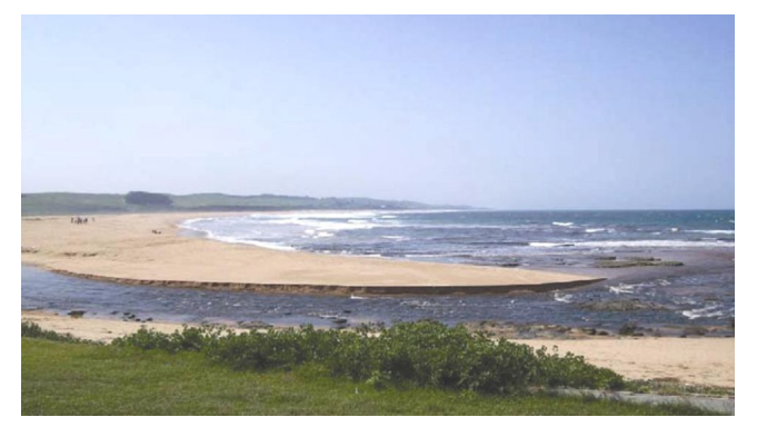
Figure 2. The mouth of the Mvoti Estuary showing the well-developed sand barrier and the deceptively pristine-looking estuary.

With the exception of Ca, which recorded a decrease in concentration over time, all other parameters yielded statistically significant increase in concentration over the period of comparison (Figure 3). This overall increase in contaminant levels has been accompanied by a concomitant decrease in DO. Levels of contaminants closer to the Mvoti mouth (E1) were lower than those recorded in the