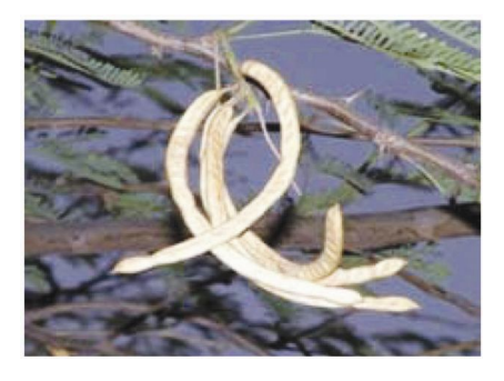
Figure 1. Legume of Prosopis juliflora.

The team<sup>1</sup> was further interested to determine whether the differences in blackbuck group size and composition had any effects on the dispersal pattern of mesquite seeds. The site of seed deposition