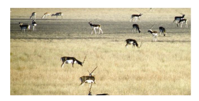
Figure 4. Male blackbucks on a lek, Velavadar National Park.