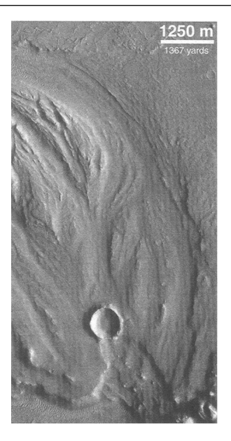
Mars flood channels. Geologic evidence suggests that the floods occurred during the first billion year of Mars's history.

speculative. Telescopic observations and later planetary missions have provided us a wealth of information, often leading to concepts contrary to the speculative era