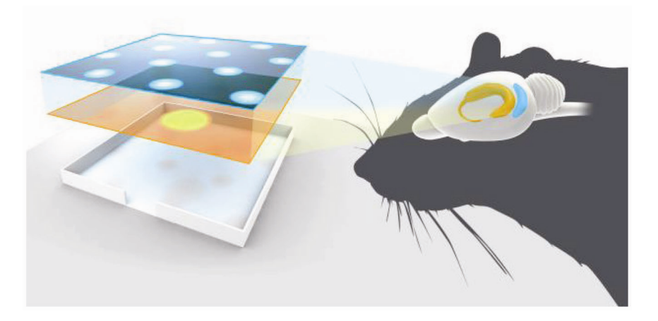
Figure 3. A schematic diagram showing grid cells (blue) and place cells (yellow) in the entorhinal cortex and hippocampus respectively. [Credits: Illustration and layout by Mattias Karlén/© 2014 The Nobel Committee for Physiology or Medicine.]

early stage, in the patients with Alzheimer's disease. These individuals recurrently lose their way and are unable to perceive the ambiance. This finding proved as a boon in understanding brains positioning system and enables us to understand the supporting mechanisms of mortifying spatial memory loss in diseased individuals. The discovery is a revolutionary step in understanding how aggregation of particular cells work together to bring to fruition of higher cognitive functions. This paved the way for several possibilities in perception of other intellectual processes<sup>27</sup>.