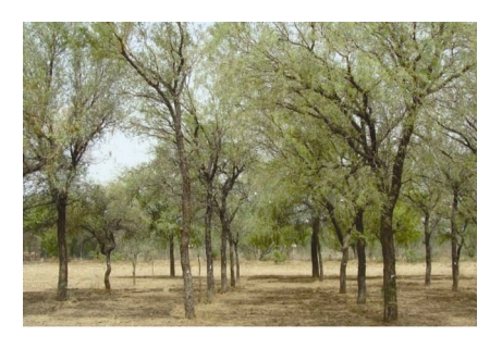
Figure 2. A Khejri stand observed for off-season flowering and fruiting.

Though Khejri is the best adapted tree in Indian Thar region, its mass mortality due to a combination of factors may threaten its sustainability<sup>8</sup>. Climate change has a profound impact on the vegetation, which may change the habitat location, and extinction of less-tolerant species9. Gopalakrishnan et al.<sup>10</sup> projected that nearly half of the forest grids (45%) undergo changes in India due to climate change and other associated factors. This changing climatic scenario has influenced agriculture, vegetation and livelihood of the local poor. Hence agriculture scientists have to be ready to face the challenges and offer solutions for sustenance of agriculture sector by means of adaptation to global climate change<sup>11</sup>. Climate change has an impact on survival, growth, flowering and fruiting season of Khejri trees. Unusual off-season flowering has been observed in Khejri during November 2011 by the present authors and it has been confirmed by subsequent observations in 2012. This off-season flowering during winter does not have significant influence on the normal flowering and fruiting of Khejri trees. If the crown is preferred for winter pruning, this off-season fruit/pod production might be an unwanted phenomenon. But it is an economical and socially important phenophase change from the already reported phenology of Khejri<sup>12</sup>. Since Khejri pods (locally called as 'sangar'