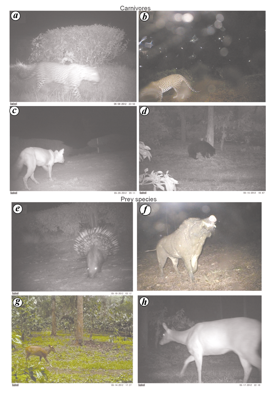
Figure 2. Camera-trap images of carnivores and prey species in the Valparai plantation landscape. a, Leopard in tea estate; b, Leopard with lights of Valparai town in the background; c, Dhole; d, Sloth bear; e, Indian crested porcupine; f, Indian wild pig; g, Indian muntjac; h, Sambar.

We obtained photographs of 12 other species of mammals in the northern and