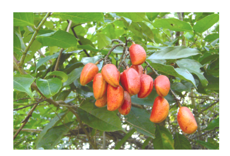
Connarus wightii Hook. f. [Connaraceae].

The book under review truly is an outstanding effort that translates several decades of intensive field observations and laboratory studies of Bhat into taxonomic information of enormous value. Each one of the 1888 species of flowering plants belonging to 928 genera from 166 families has been described with utmost accuracy in crisp botanical terms. Species profiles are further spruced up with criteria of flowering and fruiting time, native range, endemism, conservation status and such ecological and information notes as 'very rare: collected only once' for Hemisorghum venustrum; 'sometimes cultivated' for Piper longum; 'frequent along back waters and streams' for Crinum viviparum; 'common near the sea in sand' for Drimia indica and 'common on moist rocks' for Cyanotis burmanniana. Further, the English common name, the local Kannada and Tulu vernacular names recorded for most species help bring even non-botanists connected and engaged with plants and their