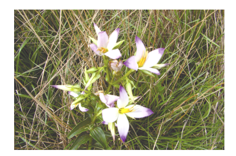
Exacum tetragonum Roxb. [Gentianaceae].

environment. The book is also sumptuously provided with colour photographs for several species.