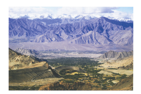
This landscape in Ladakh preserves some of the finest examples of alluvial fans and moraines of great antiquity.