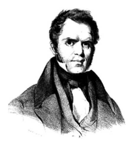
Figure 3. Robert Wight.

A significant section of cotton experiments was carried out by American