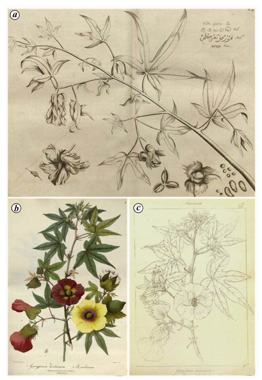
Figure 2 a – c . Gossypium arboreum from Indian botanical classics. a , From Hendrik van Rheede's Hortus Malabaricus (1678, vol. 1, figure 38). Vernacular names (Tamil [in Roman characters], Malayalam, Arabic and Sanskrit characters) shown at the right top of the image; Cadu-pariti (English transliteration and in Malayalam script) should be read as karum-paruti (paruti–cotton; karum–dark). b , From William Roxburgh's Flora indica (1819, vol. 3, figure 269). c , From John Forbes Royle's Illustrations of the Botany and other Branches of the Natural History of the Himalayan Mountains and of the Flora of Cashmere (1839, vol. 2, plate 23).

floral designs. White cotton materials with tulip, carnation, rose and daisy motifs were popular among 18th Century wealthy Europeans, floral 'sprig' designs with tiny motifs on pastel backgrounds were popular among the less-wealthy Europeans. In France, such printed fabrics were generally called les Indiennes, although they were also known as les toiles peintés and les toiles imprimés. In