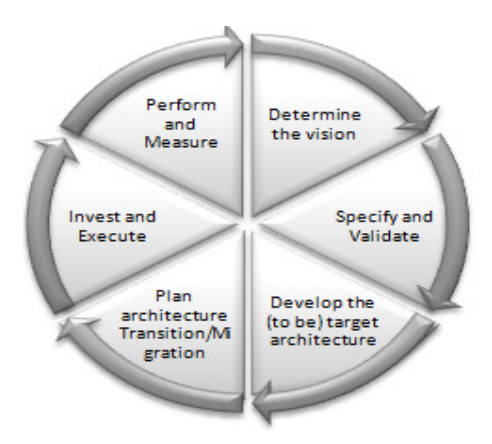
Figure 1. The proposed EA Lifecycle

Hereafter, we propose a simple process inspired by these different EAIM (eg, Figure 2).