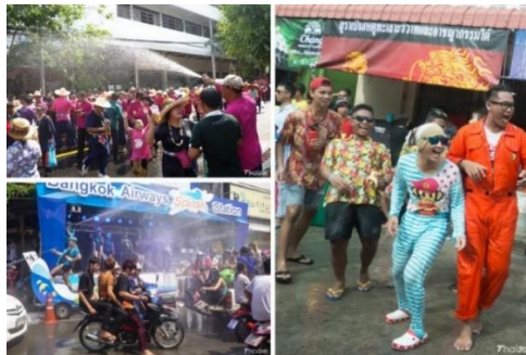
Figure 1 Images of Songkran Festival

One of the most famous Thai festivals is the Songkran festival [18]. This celebrates the New Year and takes place from 13 to 15 of April every year and has captured the imagination of visitors for both its cultural value and its fun attributes. Thai people welcome in the New Year by splashing with water, symbolically washing away the misfortunes from the past year and also bringing visitors happiness and joy during their travels[3].The appreciation of family is an important aspect of the festival, with many Thai people making their way to their hometowns to spend time with older relatives[28]. Buddhists visit temples during Songkran where they pour water onto statues of Buddha and over the hands of Buddhist monks as a mark of respect.