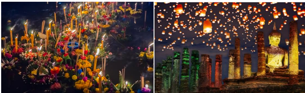
Figure 2 Images of the massive lantern on Yi Peng and Loi Krathong in Chiangmai

The Light Festival, or Loi Kratong, is one of the most beautiful festivals in Thailand and is celebrated throughout the country[33]. It takes place on the evening of the full moon of the 12th month in the traditional Thai lunar calendar (in November). In Chiangmai (Northern Thailand) the Light Festival combines with Yi Peng, a lantern festival and the two are celebrated together. The largest city in northern Thailand, Chai Mai, is known for its flying lanterns rather than its floating offerings. People who visit Chiang Mai during the few days of the festival can also enjoy some of the city's most incredible parades, firework displays, and traditional art performances in public places[35].