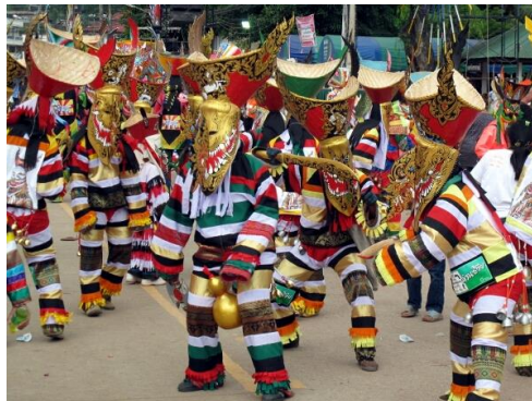
Figure 3 Phi Ta Khon Festival in Lei district

In the past two decades, evolving technology has moved this world into the digital age. Most people have portable devices such as smart phones and tablets and connect to the internet all the time. This behavior impacts the tourism industry, particular festivals and events. The effective marketing methods are using internet technology like social media to develop festivals.