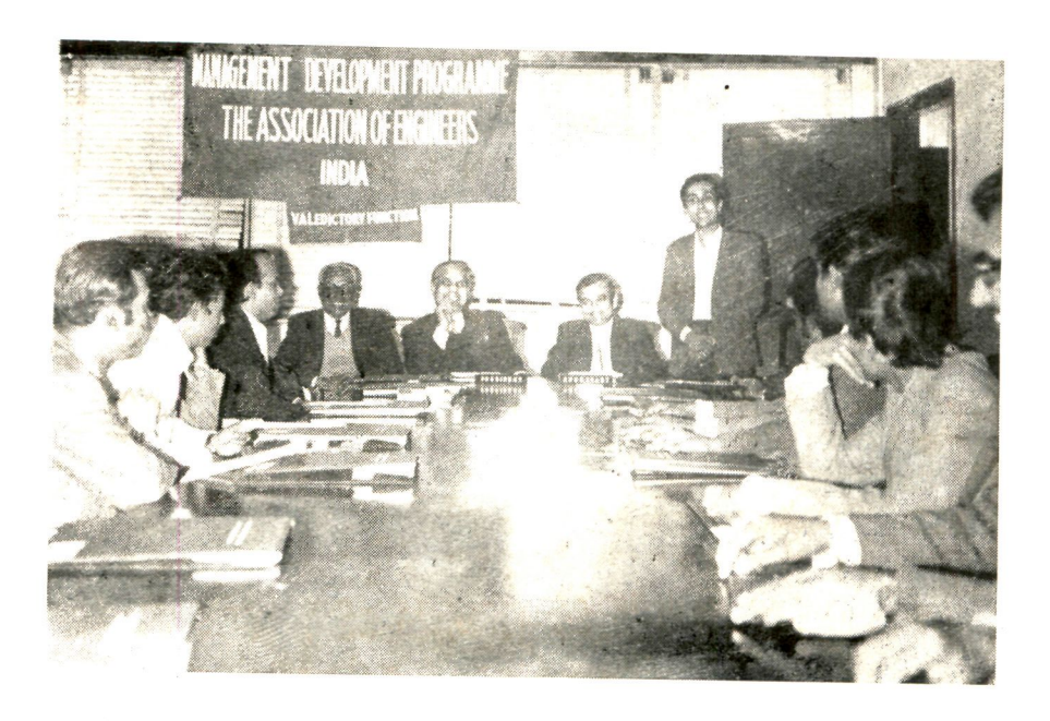
A Section of the participants