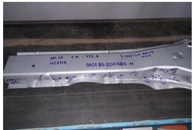
Fig. 2: Sheet metal parts of cars

The company under consideration manufactures inner body parts for the cars. These sheet metal parts are shown in figure 2. Each part requires spot welding for assembling the job. As discussed earlier, the task of spot welding of the metal sheets was carried out manually. The process is now carried out with the help of robots. The welding process / operation of making the parts in the company's project are operated by spot welding robots only. The company has a total of seven cells for the project where six cells are assigned for spot welding and one for CO 2 spot welding. Each cell contains two robots and multiple fixtures. Fixtures have the sensors which sense the proper position of metal parts during the welding process. Mimic model is used for getting the overview of the position of the welding spot on a particular part. Safety sensors are available to the cell, which protects the employees when the robot is in working condition. To identify the failures in the process, the process of FMEA implementation in the company has been discussed below.