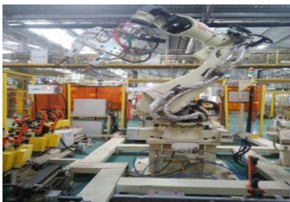
Fig. 1: Spot welding robot

The spot welding process carried out in the company is shown in figure 1. Some movements that are awkward for an operator, such as positioning the welding gun upside down, are easily performed with the help of this robot.