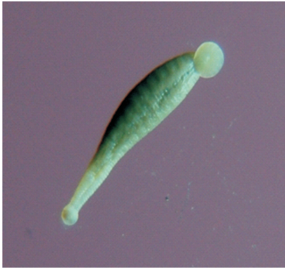
Hemiclepsis charwardamensis (Ventral)