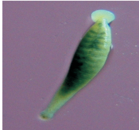
Hemiclepsis charwardamensis (Dorsal)