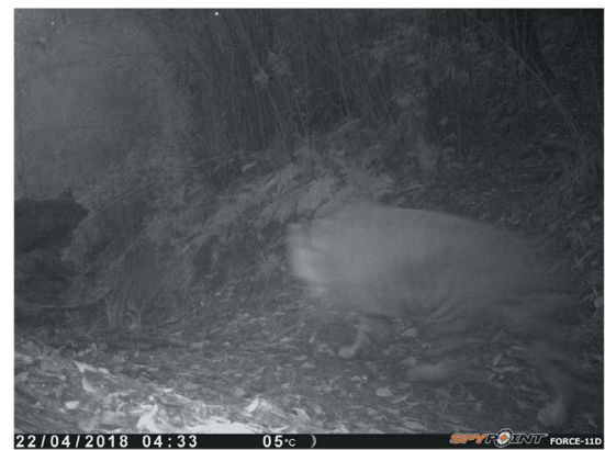
Figure 3. Recorded tiger left view at Kattus Dara, Neora Valley National Park.