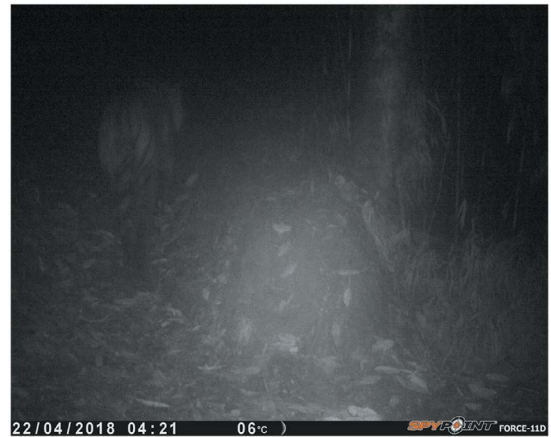
Figure 2. Recorded tiger back view at Kattus Dara, Neora Valley National Park.

tigris corbetti ) is yet to be confirmed (Luo et al. , 2004). Whether the Neora Valley National Park is serving as a corridor between lower terai landscape and forests of Sikkim and Bhutan or is a viable area for tiger residence has remained to be studied. Further studies in the region with camera traps and molecular investigation may reveal relations between the populations.