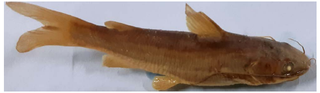
Mystus gulio (Hamilton, 1822)