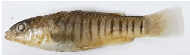
Aphanius dispar (Rüppell, 1829)