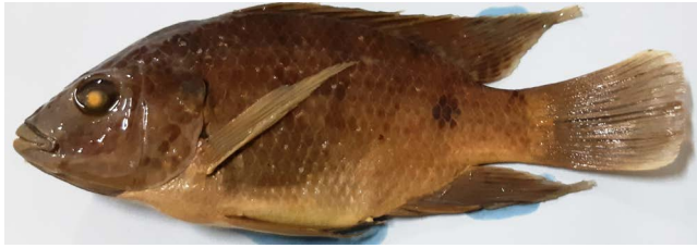
Oreochromis mossambicus (Peters, 1852)