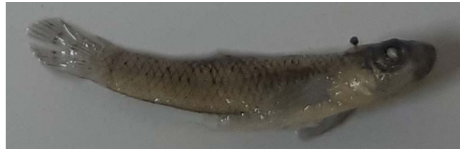
Gambusia affinis (Baird & Girard, 1853)